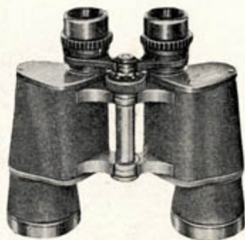
7 x 50, 10 x 50, 12 x 50, 16 x 50, 20 x 50 (CF)

These prismatic binoculars are so constructed that the image formed by the objective lens and erected by the right angle prism may be magnified.