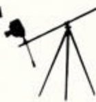
FREE HORIZONTAL INCLINING (ADVANCE AND RECESS)